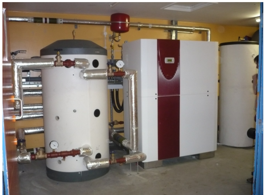
The above picture is the installed Dimplex 50KW Ground Source Heat Pump with hot water cylinder and a solar buffer tank.

The project took three months to complete and the Meadow Well community are delighted with the results. As well as the carbon saving, the costs for the centre's heating will be drastically reduced. The project was completed in March 2008.