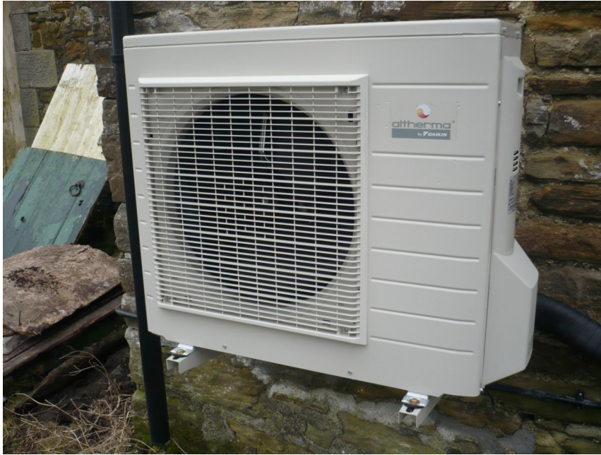
Daikin Altherma 8KW Air Source Heat Pump

Our clients were developing a café on their farm and wanted a renewable way of heating the building, including a bunk house a wash room area and provide hot water for the kitchen.